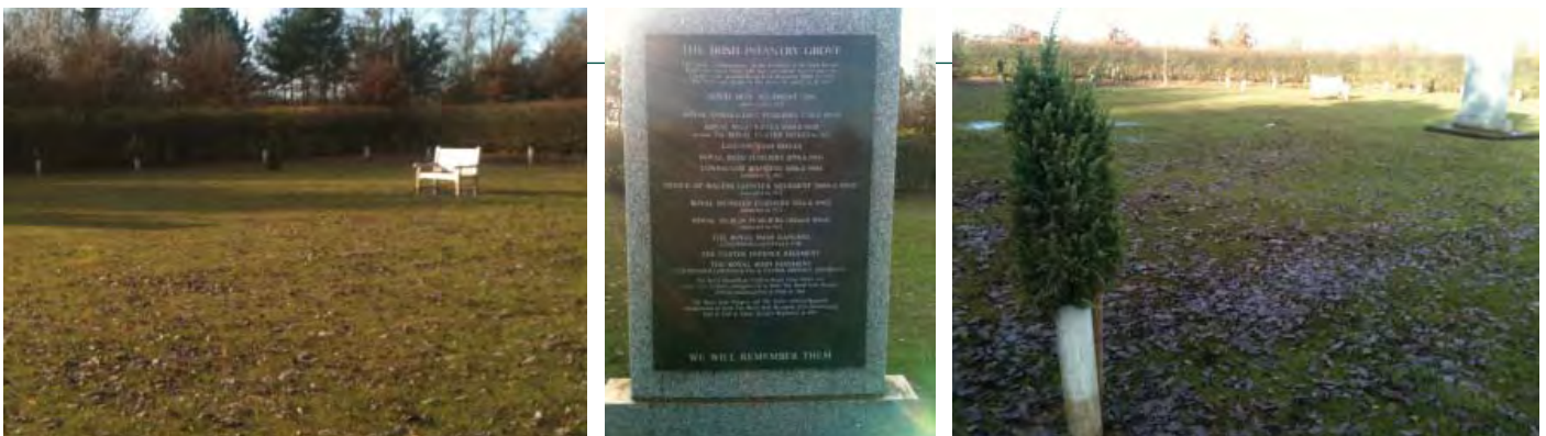
— THE GROVE TODAY —

A project has been launched to develop the Irish Infantry Grove in a way which will establish it as a focus for all with a connection to the Irish Infantry Regiments of the Line. This development will also achieve the original premise of "... an acre of Ireland in the heart of the British Isles ...".